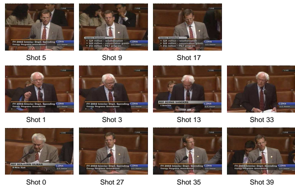
Fig. 4. Shots belonging to clusters 12, 13, and 14 from the sequence cspan17 . First and third clusters form a false split and the third cluster has a wrong grouping error.

In this paper we have described a system that uses multimodal features to detect unique people appearing in news programs and illustrated our results using data obtained from C-SPAN. For most programs our system is able to accurately detect the people in programs. However, errors may arise when the audio for a shot does not belong to the person shown in the shot. We are implementing measures based on audio continuity to solve this problem. We are also looking into learning algorithms to automatically determine weights for the three different kinds of shot distances to increase performance.