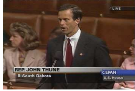
Fig. 1. A typical frame extracted from a C-SPAN program. The lower part with on-screen graphics is ignored when calculating the keyframe histogram feature.

For each shot we extract acoustic vectors consisting of the 20 mel-frequency cepstral coefficients obtained every 10 ms using a 20 ms Hamming window. Let \mathbf{x}^i = \{x^i(k) \in \mathfrak{R}^n, k = 1, \dots, N_i\} and \mathbf{x}^j = \{x^j(k) \in \mathfrak{R}^n, k = 1, \dots, N_j\} be acoustic vectors extracted from shots s_i and s_j , respectively, where N_i denotes the number of 10ms segments for shot s_i and n is the dimensionality of the