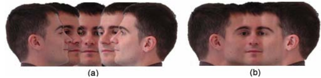
Fig 1 (a) Set of images used for the creation of the training data; (b) Example of a 180° texture training image

P^2CA [1] is a novel face recognition approach based on 2DPCA that enables the projection and recognition of 2D texture images on a 3D data trained system. The main problem of our system is that the gallery set is composed of 180° cylindrical texture images as the ones presented in Fig 1 which has been manually created by morphing a total of five different views of the person. The reference points used for aligning the five images have been the two eyes and the two ears. So, one of the main drawbacks of P^2CA is the necessity of these five different views images if a new person should be enrolled on the database. For this reason, in the next section a new proposal is presented in order to get automatically this kind of 180° texture images from one or two different image views.