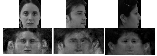
Fig 4 (Top) Input images. (Bottom) 180° Output

being M , the total number of Eigenfaces used for the reconstruction. Fig 4 shows three different examples of 180°